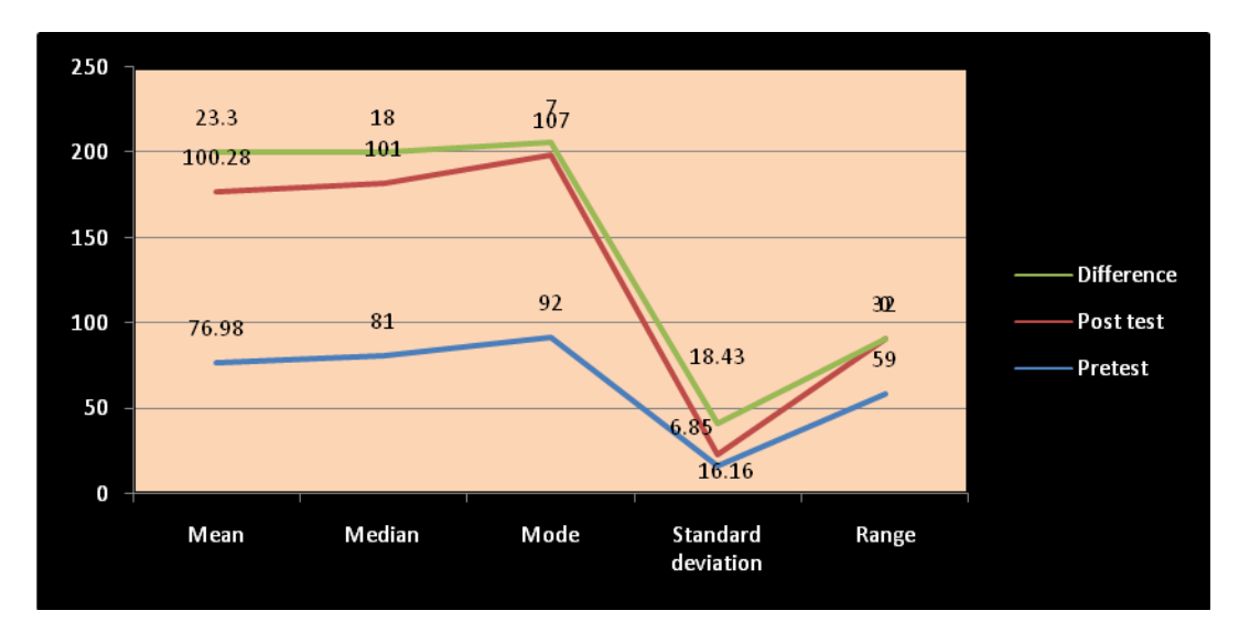
Graph 2: Line graph showing Mean, Median, Mode, Standard deviation and Range of pregnant women according to pretest and post test perception scores and its difference.